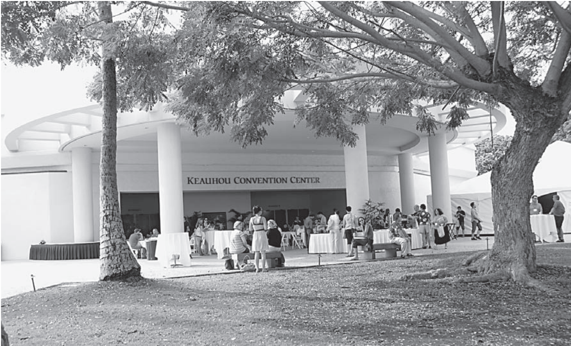
Sheraton Keauhou Bay Resort & Spa, site of SSR's Annual Meeting in May.