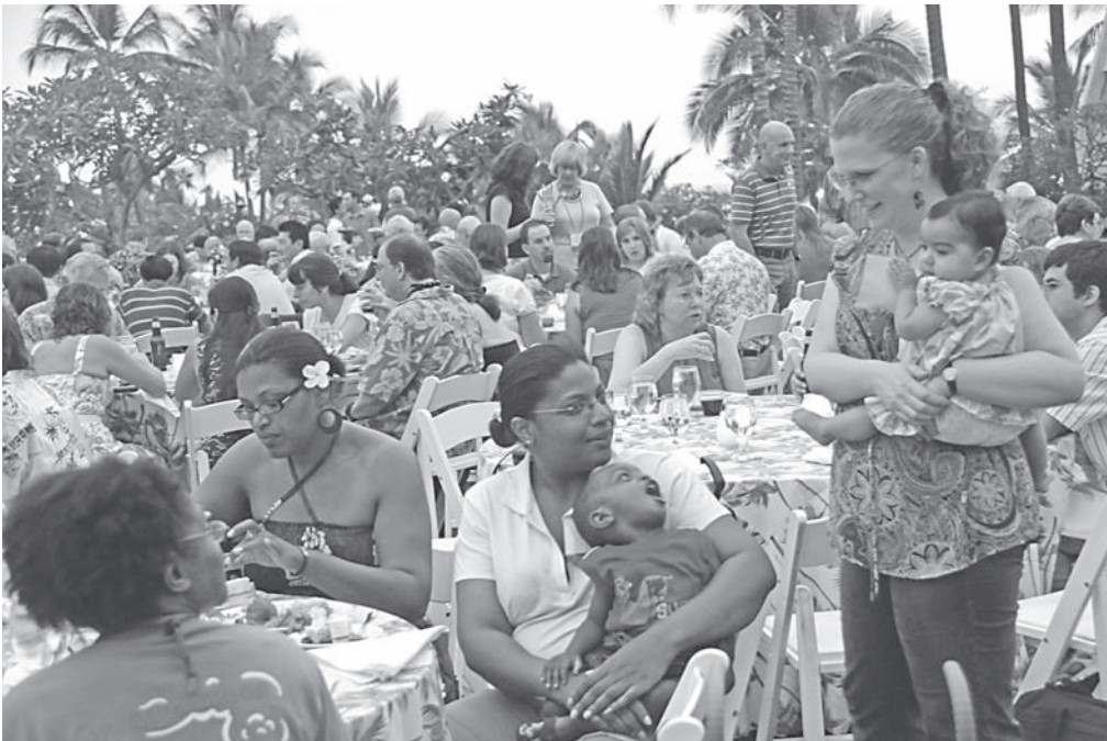
At the barbecue.