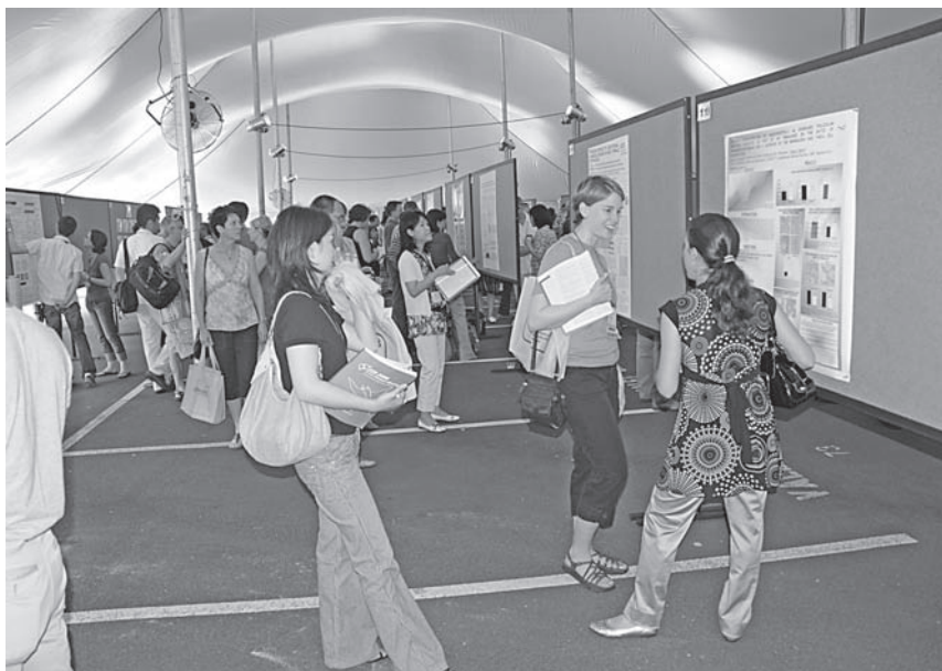
Posters under a tent.