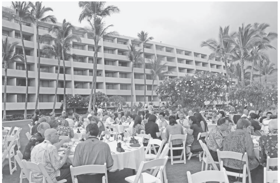
At the banquet.