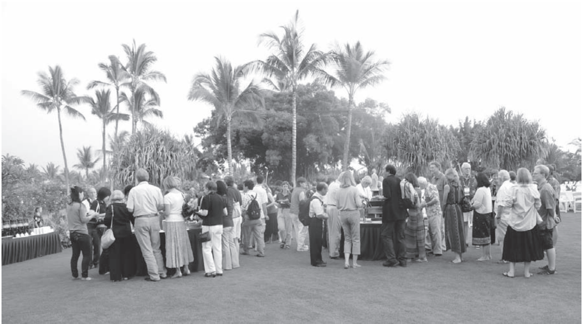
Dinner on the lawn.